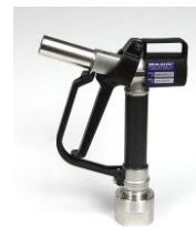
DM-800HFR/L6 Series Nozzles 316 Stainless steel & Teflon